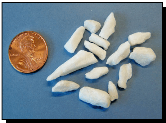
Photo 2 - N-Benzylmethylamine Hydrochloride

The DEA Southwest Laboratory (Vista, California) has recently received various exhibits of white, crystalline powders and “Ice”-like crystals, presumed methamphetamine (see Photos 2 and 3). The exhibits were also packaged similar to bulk methamphetamine (for example, in plastic containers wrapped with cellophane and tape, in zip-lock plastic bags, etc.). Analyses by Marquis (negative), nitroprusside (positive), GC/MS, and FTIR/ATR, however, indicated not