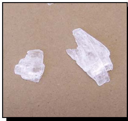
Photo 3 - N-Benzylethylamine Hydrochloride